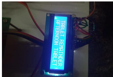
Fig 2: This LCD display shows the remainder of afternoon tablets