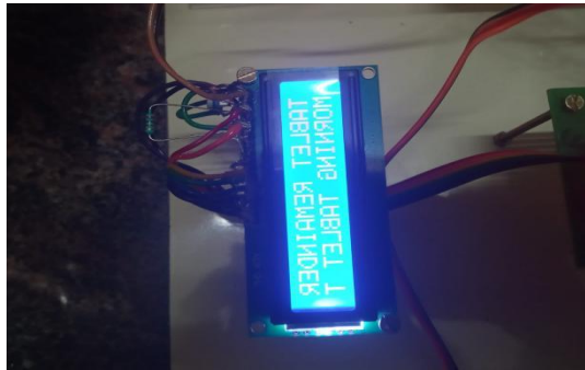
Fig 1 : This LCD Display shows the remainder of morning tablet

Figures shows the results of text detection from an image