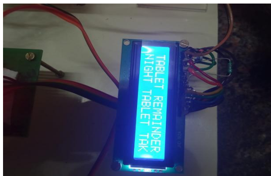
Fig. 3 This LCD display shows the remainder of Night tablets